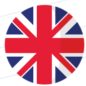
The United Kingdom