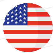
The United States of America