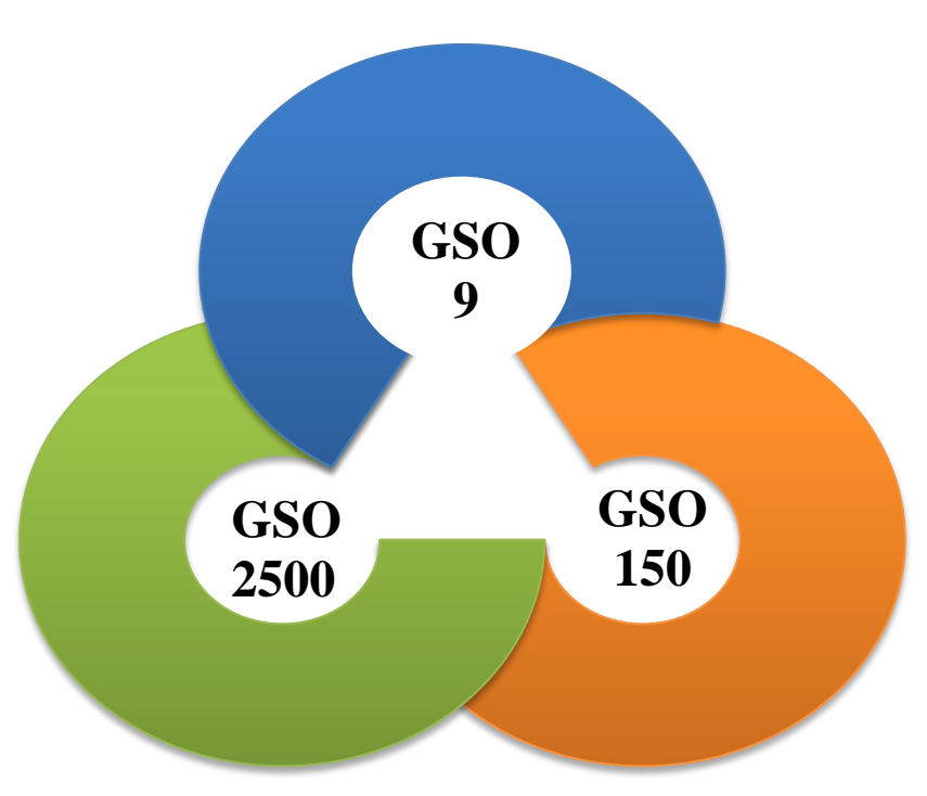
Labeling of prepackaged food stuff

Additives permitted for use in food stuff